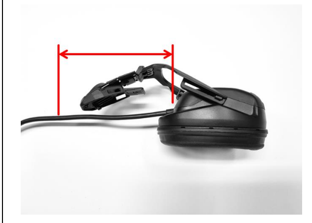
1. Make a mark on the cable 13 cm (5.1 in) from each earmuff.