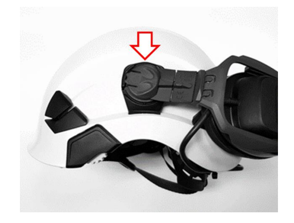
2. Put the earmuff attachments in the slots on the helmet.