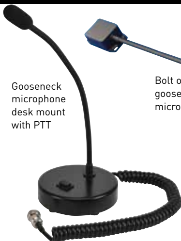
Gooseneck microphone desk mount with PTT