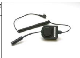
PTT7000 with TJ101 quick disconnect connector

Headset order code: 75332 MIL-Spec 75328 Industrial Spec Standard colour: Black